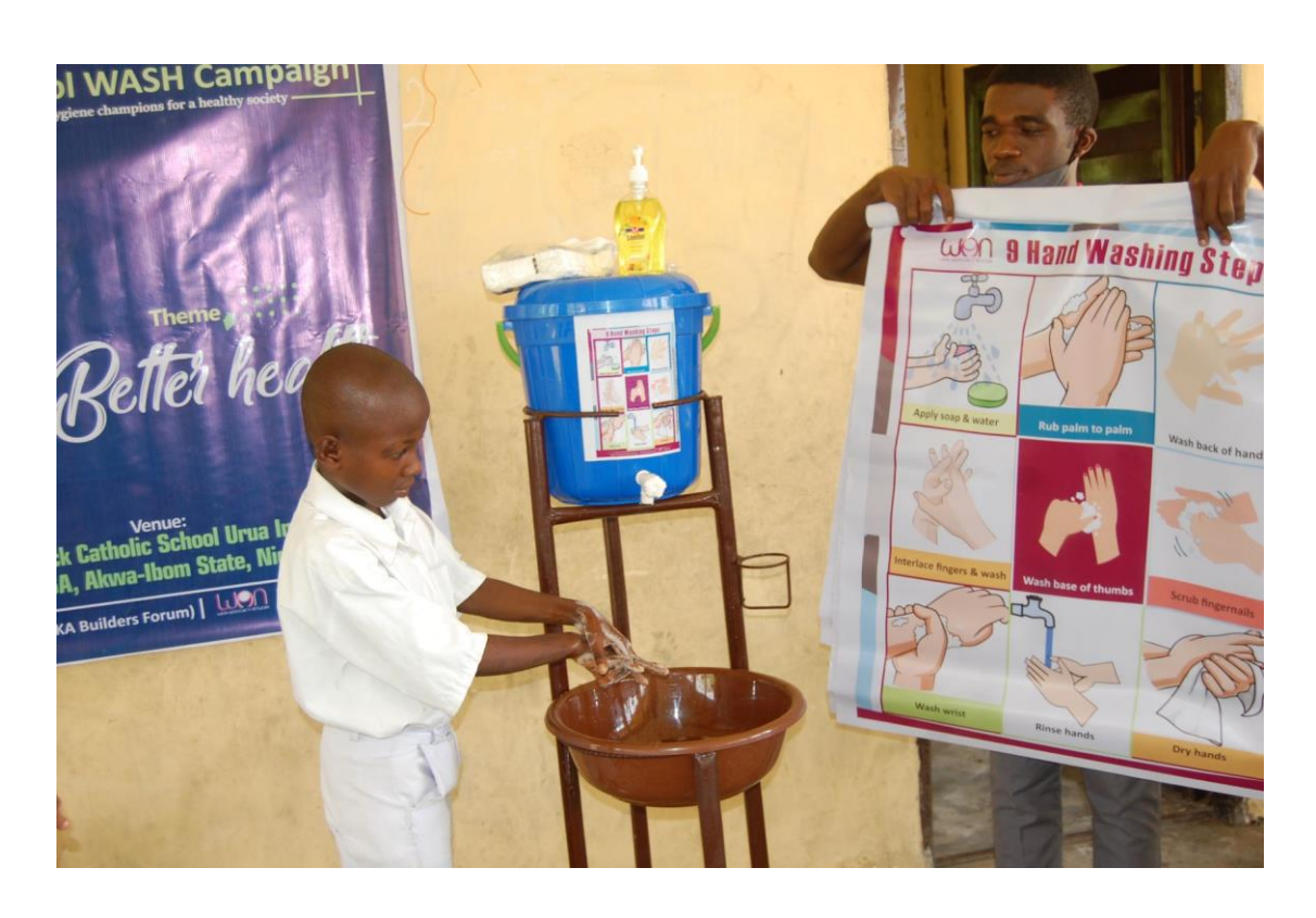
Student demonstration section.