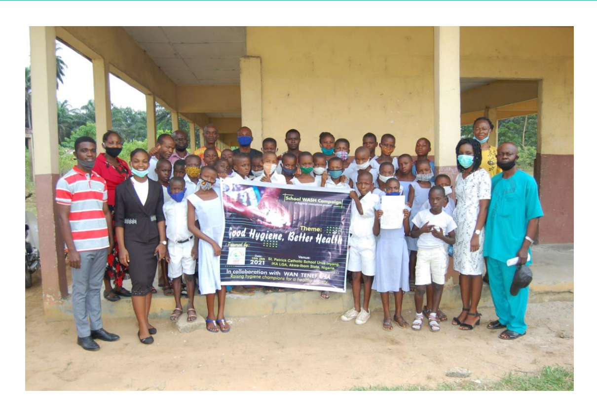
Group photograph of students, facilitators and teachers.