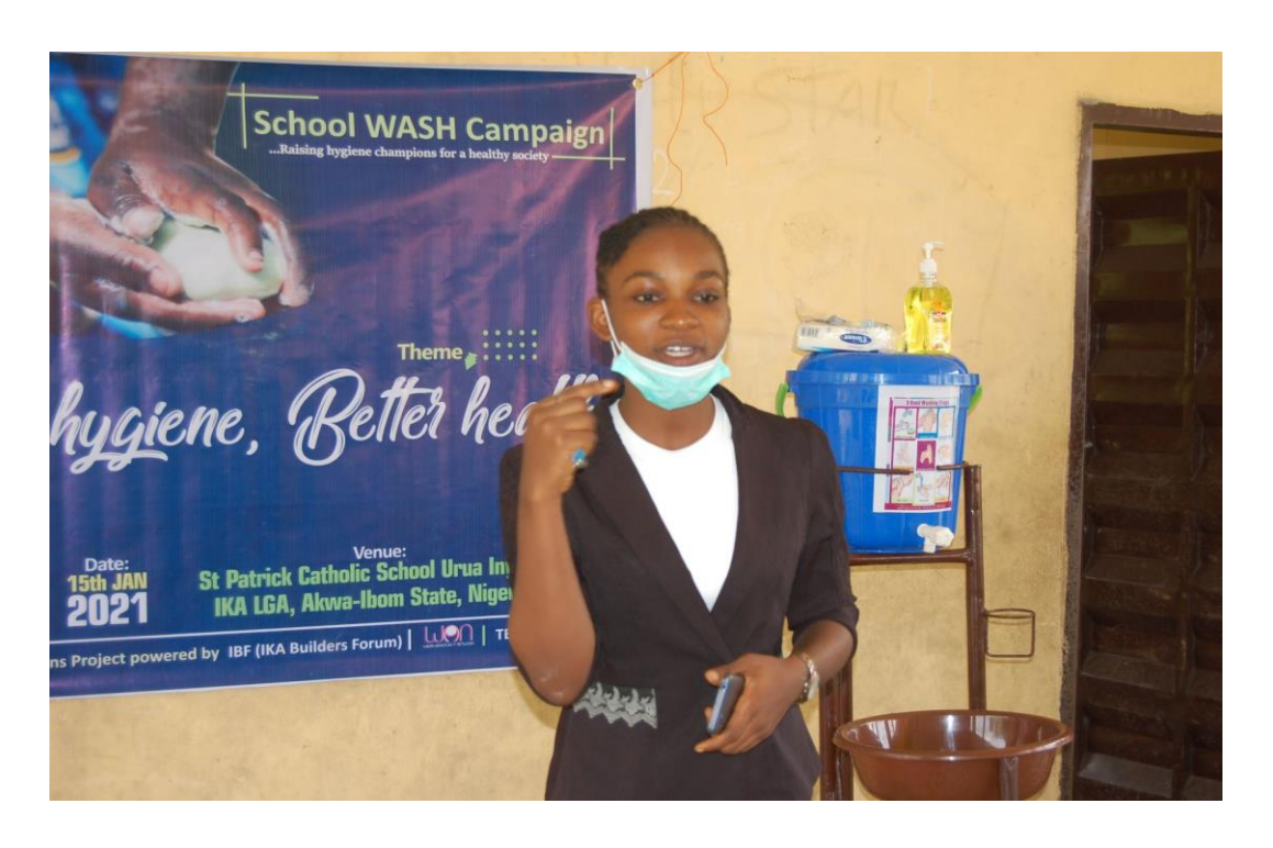
Facilitator training participants on body hygiene.