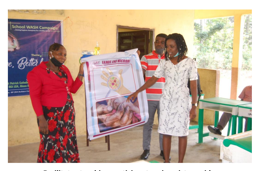
Facilitator teaching participants using picture aids.