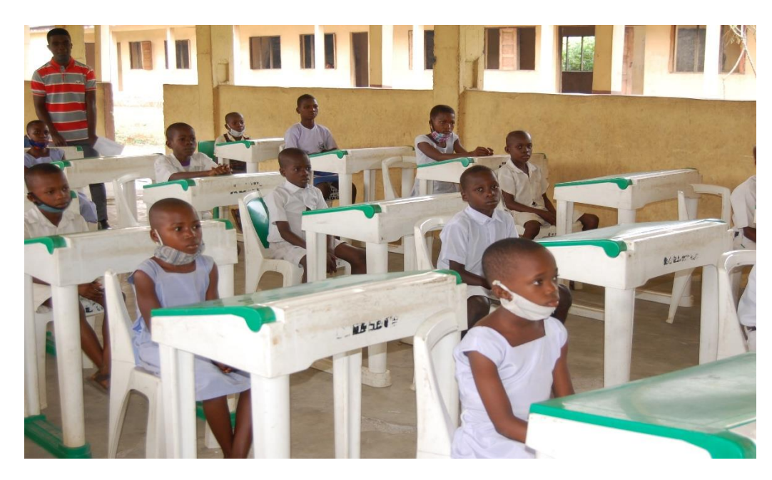
A cross section of participants during training.