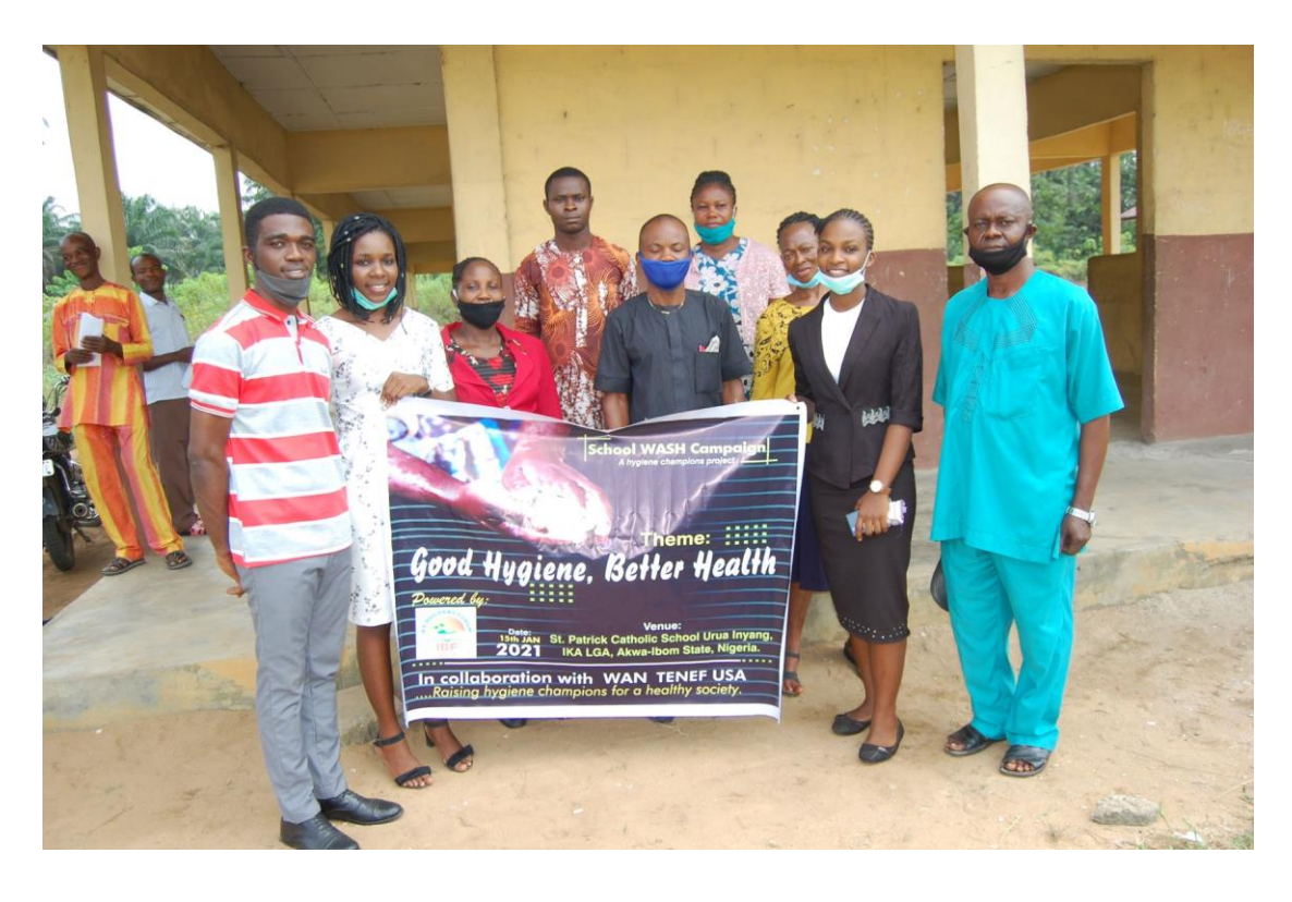
Group photograph of facilitators and school teachers.