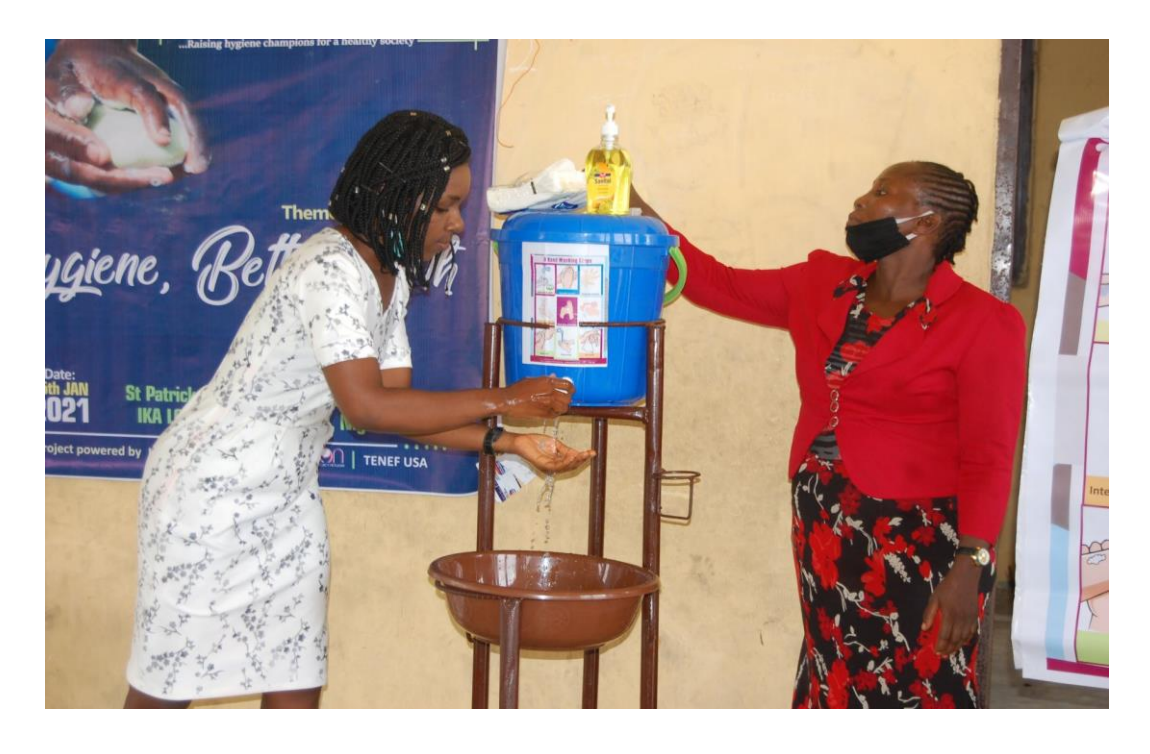
Facilitator training participants on proper hand-washing techniques.