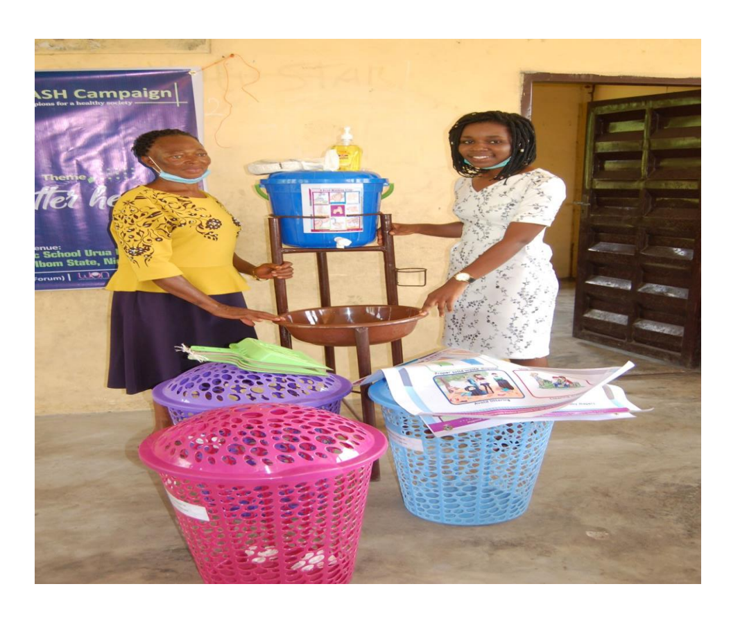
Donation of hygiene materials to the school.